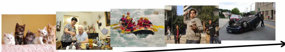
Figure 1. Examples of the picture stimuli.

task was an episodic long-term memory task, and not a working memory task. Participants were instructed to orally report in English all of the pictures they remembered seeing, and to describe them in as much detail as possible, so that coders could match descriptions to individual pictures. After describing all the pictures they remembered seeing, participants were encouraged to make a second and third attempt to remember additional pictures, and were given as much time as they needed at each attempt. The extra attempts and unlimited time were meant to ensure that episodic memory was being assessed, and not their ability to quickly generate adequate linguistic descriptions. At the end of the study, participants rated the pictures based on valence (scale of 1–9, 1 = very negative, 5 = neutral, 9 = very positive) and emotional arousal (scale of 1–9, 1 = calm, unaroused, 5 = moderately aroused, 9 = excited, stimulated). The set of pictures was chosen to represent varying levels of valence and emotional arousal, since previous studies indicate that these factors affect memory in bilinguals (Marian & Kaushanskaya, 2008) and in older adults (Charles,